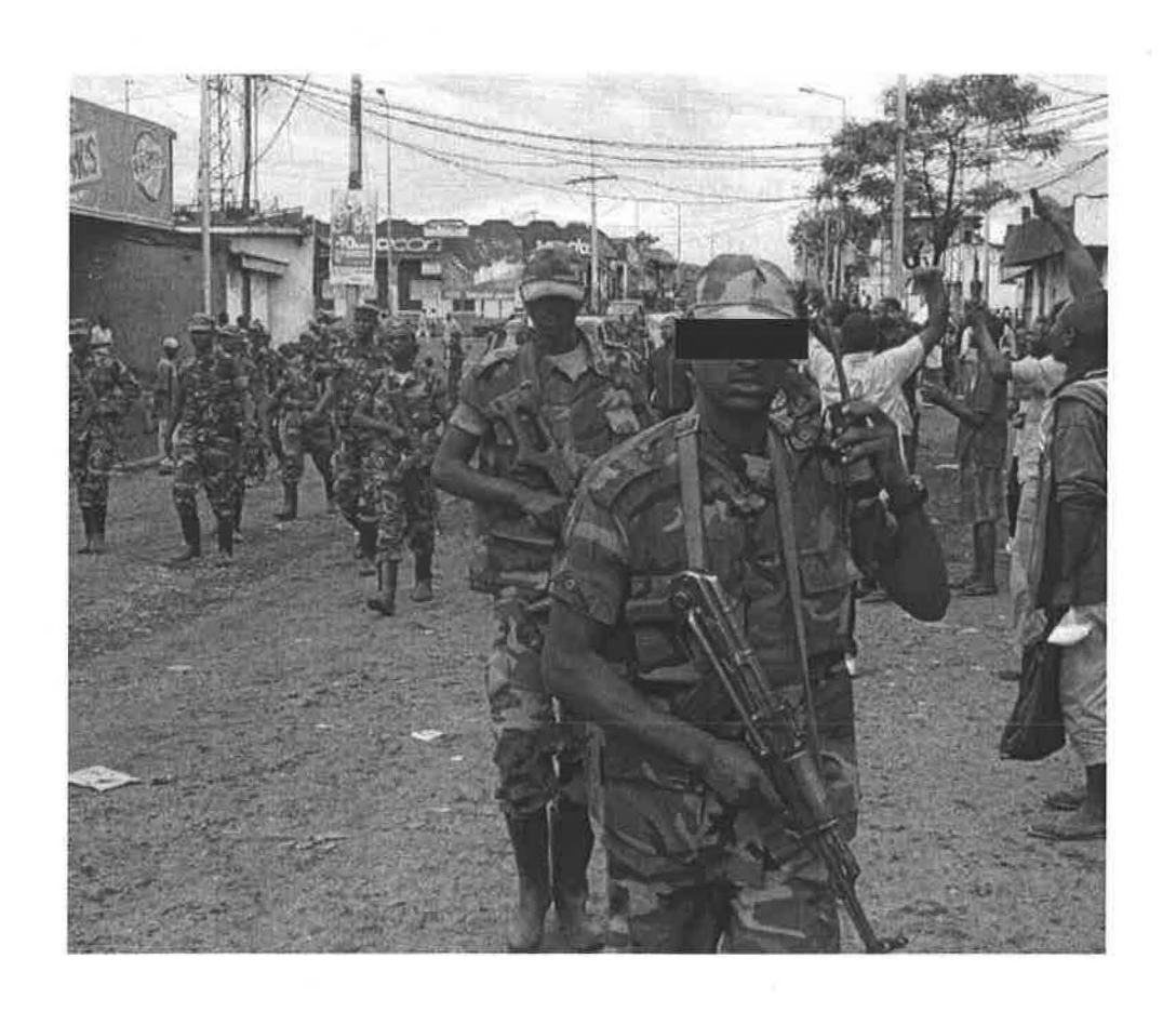
Annex 9 Photo of M23 soldiers arriving to Goma wearing RDF uniforms.