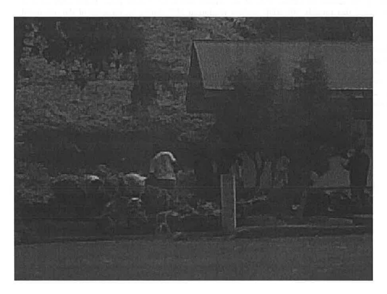
Annex 1 Boots delivery to the rebels at Bunagana witnessed by the Group on 14 October 2012.